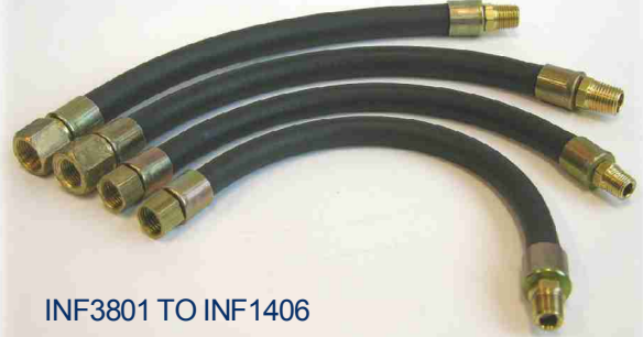
INF3801 TO INF1406